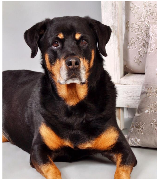
Wilslands Gracious Princess CGC "Anna" 9/28/2009 - 1/6/2020 Here is the perfect example of why we have contracts with our puppy owners