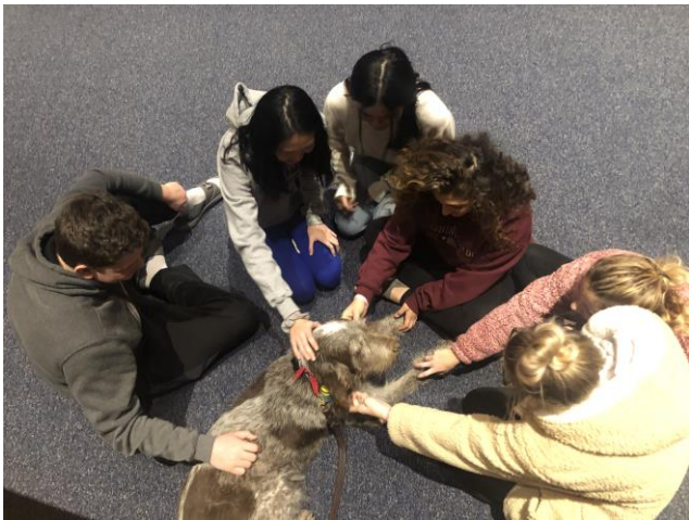
Drago is continuing to do therapy visits and has a destress event at Foran High School total of 36 regular visits and 19 library.