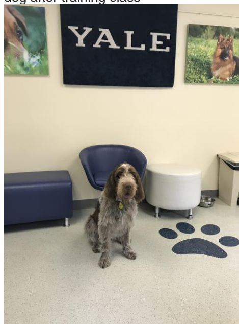
Veloce is continuing to do therapy visits and now has 50 visits. He has earned his second major at the Springfield Kennel Club show.