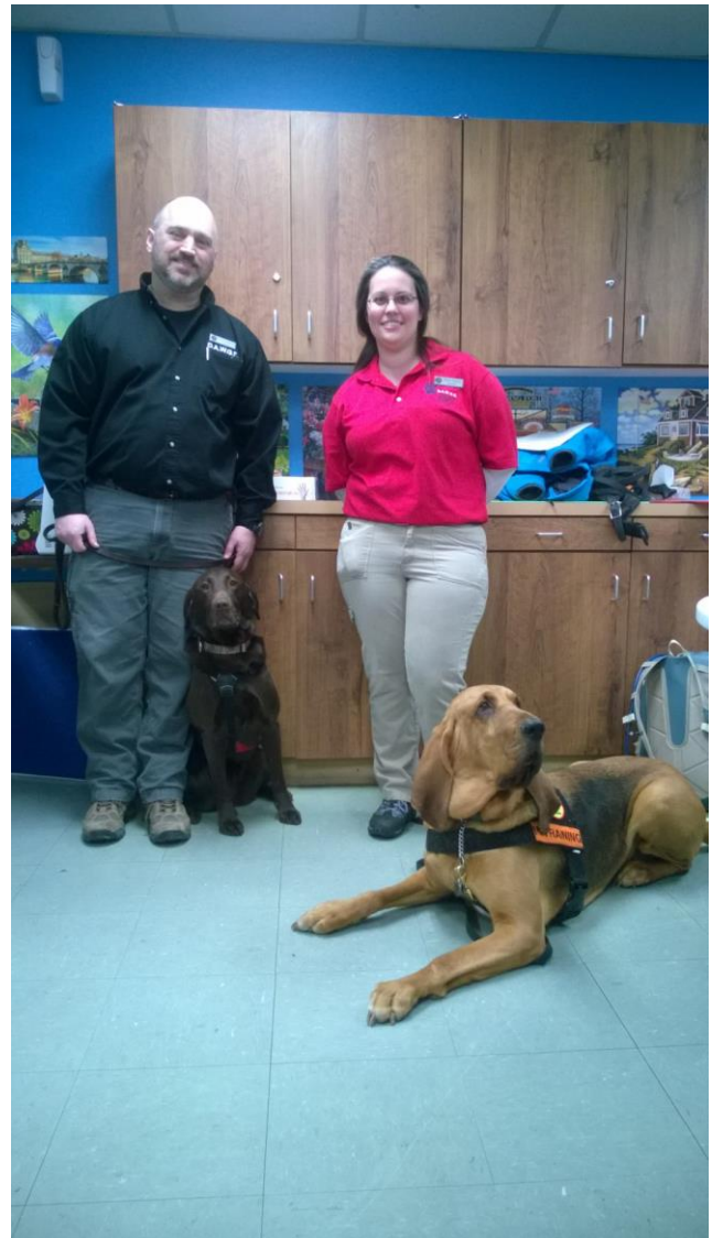
The April meeting guest speakers from D.A.W.G.S.