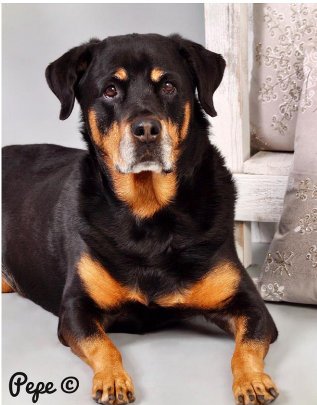
This is why we have puppy contracts. When "her person" suddenly passes and the family no longer