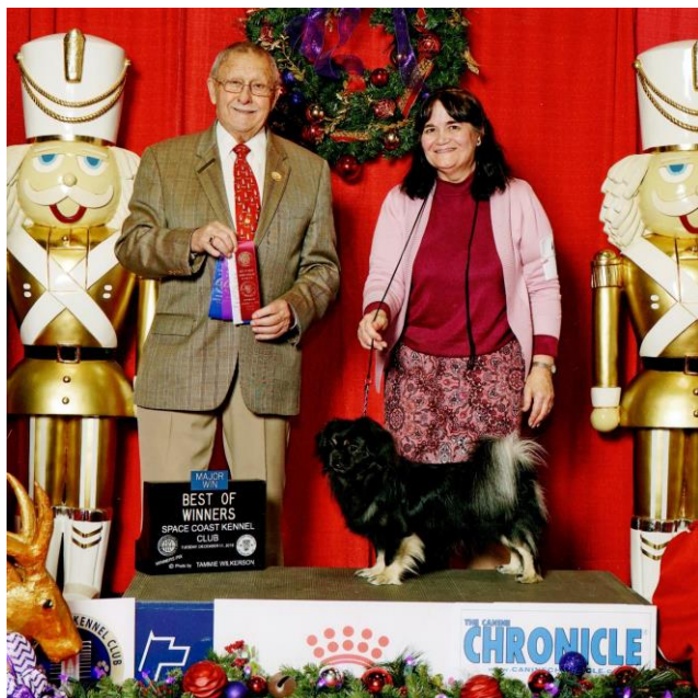
New Champion CH. Kan' Sing's Yarlung Tsangpo "Tashi"