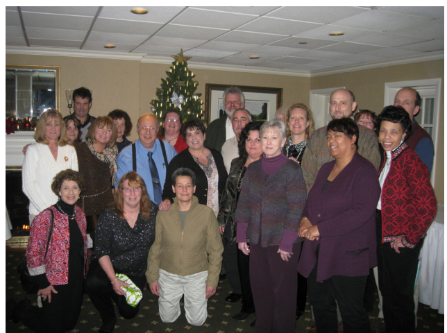
2013 TFKC Christmas Party