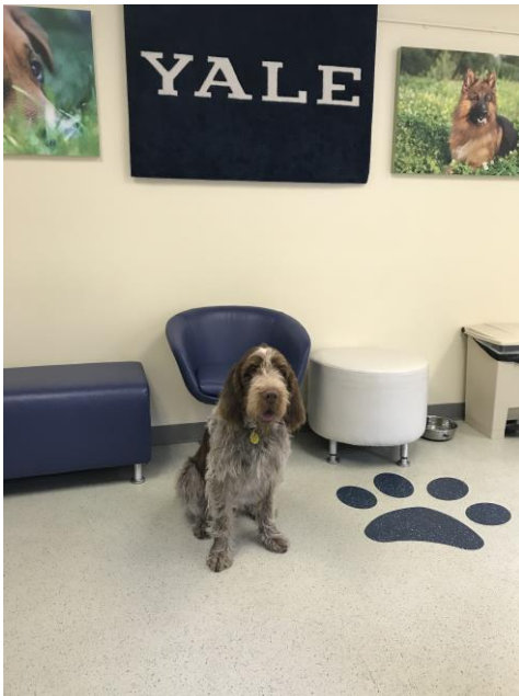
Veloce is continuing to do therapy visits and now has 50 visits. He has earned his second major at the Springfield Kennel Club show.