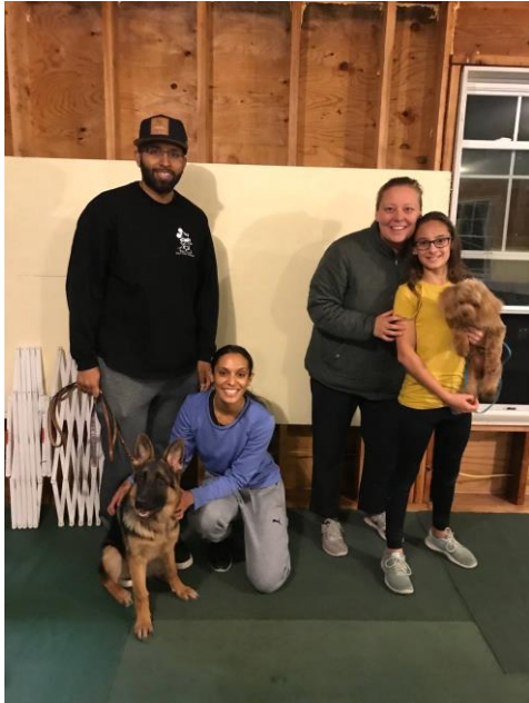
Congratulations to "Jada" and "Macy" who earned their STAR Puppy.