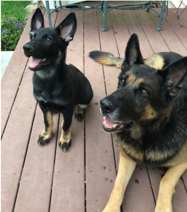
Welcome Adalwolfa to the Macaуда family... arriving at eight weeks old and 11 1/2 pounds. She loves being out in the garden. She adores our 10 1/2-year-old male shepherd who weighs 110 pounds