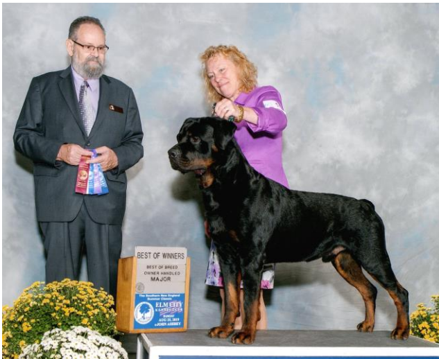
August 25, Elm City KC Springfield Mass Wllslands Klouds 'Round the Moon "Floyd" was W/BW/BOBOH for 4pts, Wllslands Imagine Martini at Midnight "Olive" was WB for 4pts under judge Mr. Rolland Pelland