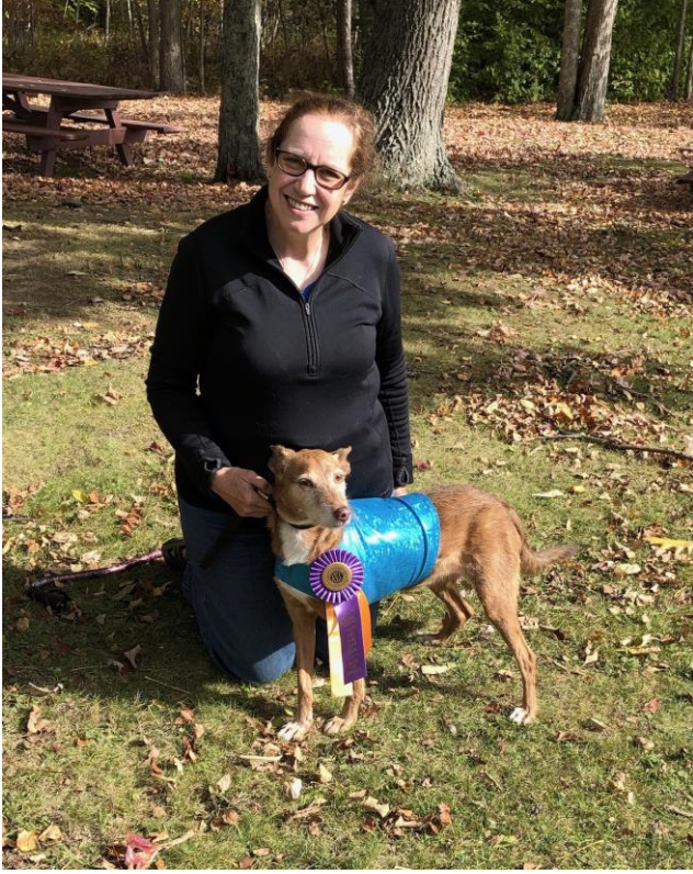
Bella, a veteran, was AKC lure coursing Best of Breed at the CLASS field trial in Westerlo, NY, on October 12, 2019. Bella's full name is Belle Chance CD BN RA MC CAX CGCA CGCU.