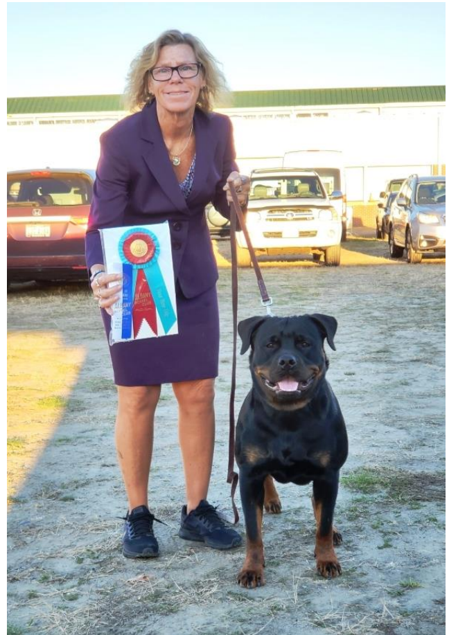
October 19 2019, CH Wilslands Kaptain Von Lutters V Bethany Farms, "Kaptain" was BOB for 5 GRCH points and BOBOH Working Group 3