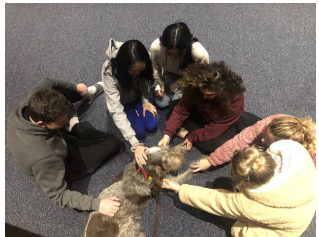
Drago is continuing to do therapy visits and has a total of 36 regular visits and 19 library.