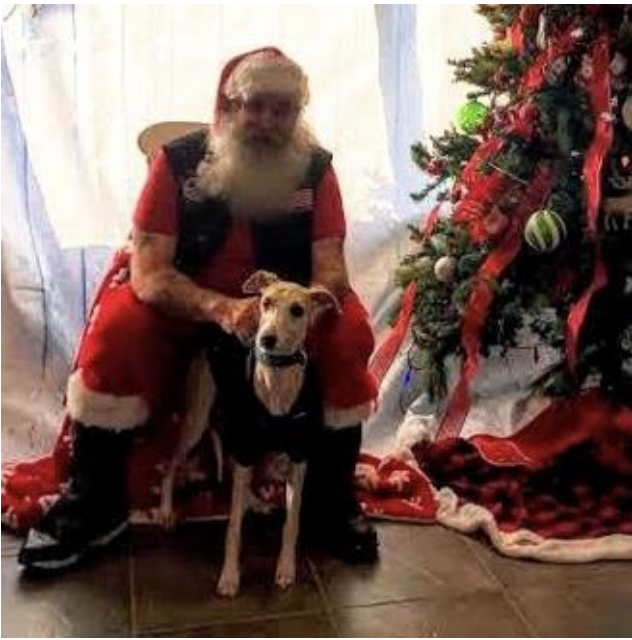
Lewis continues to do Meet and Greet visits every time he gets the opportunity. He enjoyed telling the nice "Biker Santa" at Danbury Harley Davidson what he wanted for Christmas last December 7th. Santa was unique: he had a Harley, a leather vest and tattoos! Lewis's full name is Hamrya's Keep the Change SC.