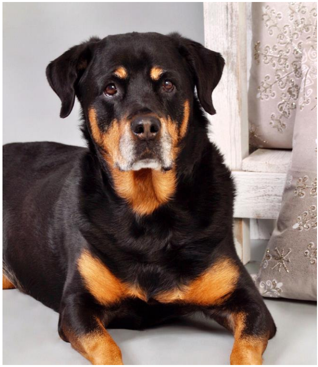
Wllslands Gracious Princess CGC "Anna" 9/28/2009 - 1/6/2020

Here is the perfect example of why we have contracts with our puppy owners