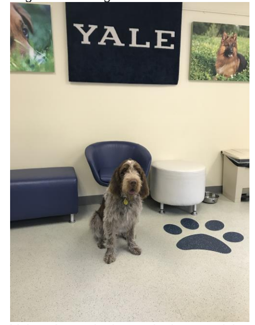
Veloce is continuing to do therapy visits and now has 50 visits. He has earned his second major at the Springfield Kennel Club show.

January 2020 brought unreasonably warm temperatures in the 60's. Who would think an afternoon run would warrant a T-shirt and a happy dog after training class