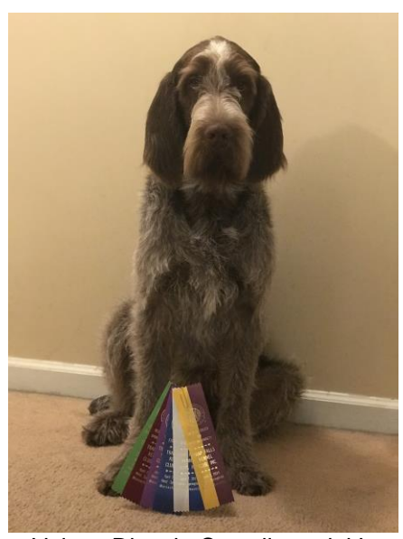
Dry Grass Veloce Diavolo Castellano del Lago CGCA TKI RI BN THDN, completed his Beginner Novice obedience title on April 6th and earned one leg toward his CD on April 7th. This was at the Trop KC show and Trap falls Show.